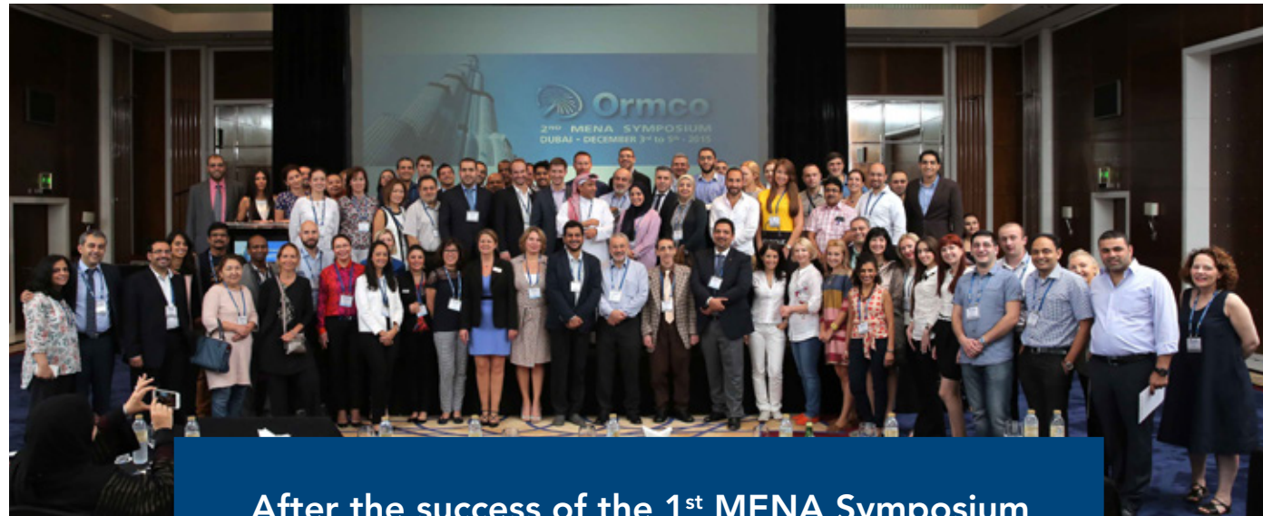
After the success of the 1 st MENA Symposium in 2013 ORMCO conducts the 2 nd MENA Symposium in Dubai