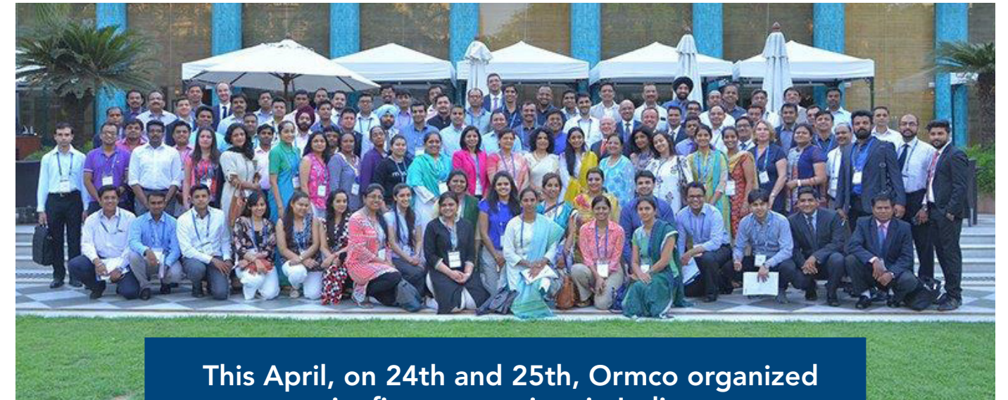
This April, on 24th and 25th, Ormco organized its first symposium in India.

With 2 international and 2 national speakers in this program: